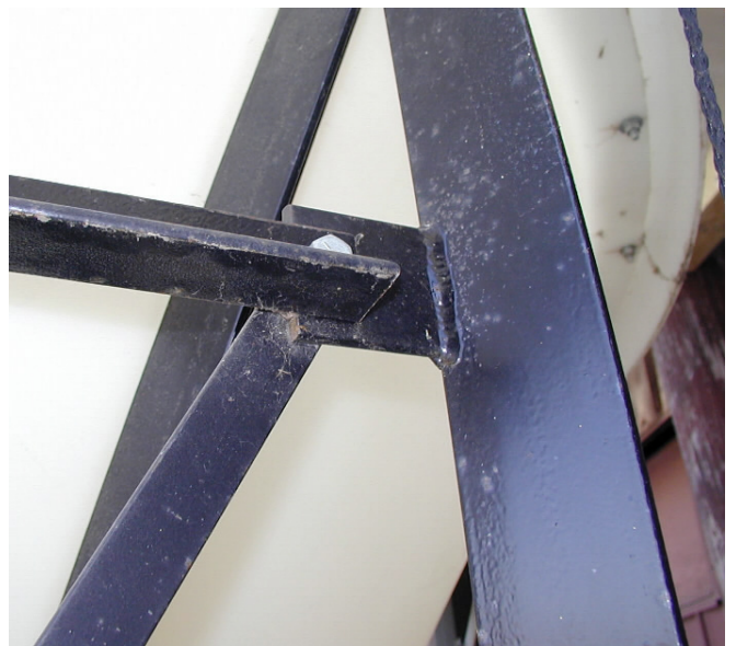
Upper Right Leg Assembly