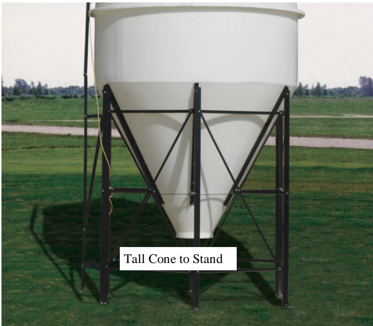
Tall Cone to Stand

Now tighten all the other bolts in the frame work.