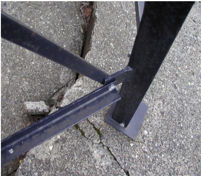
Lower Right Leg Assembly