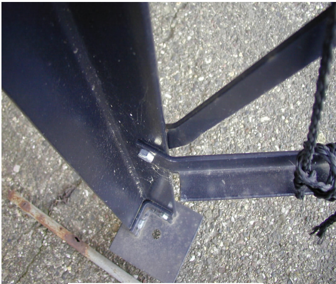
Lower Left Leg Assembly

With help stand 2 sections and fill in between them the same way you built the first 2 sections this will form 1/2 a hexagon, now fill in between the remaining sections to form a full hexagon. Finger tighten the bolts only.