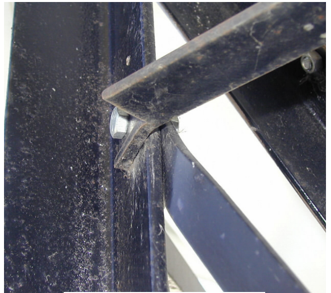
Upper Left Leg Assembly